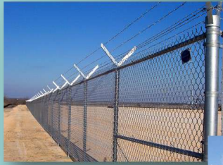
Federal Government Specifications