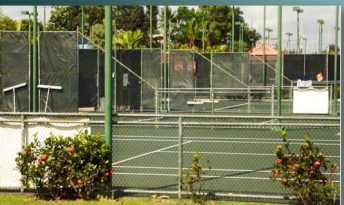
Tennis and Basketball Courts