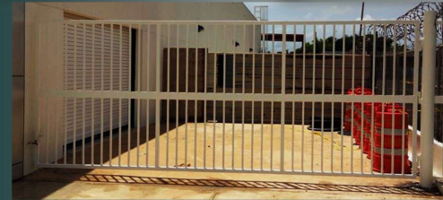
Iron Gates (swing / sliding / electrical)