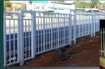
Over Concrete Walls