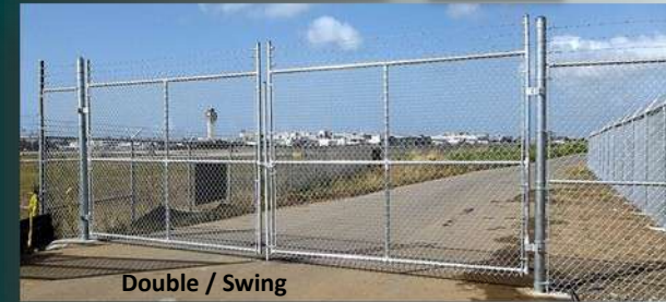
Double / Swing